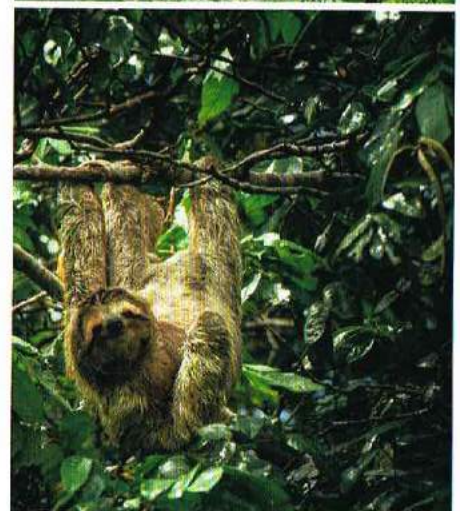
Opposite: Mistico Arenal Hanging Bridges Park. This page, from top: Arenal volcano in the eponymous national park. Rafting on the Pacuare River to reach Pacuare Lodge. The ubiquitous sloth, an icon of Costa Rican wildlife