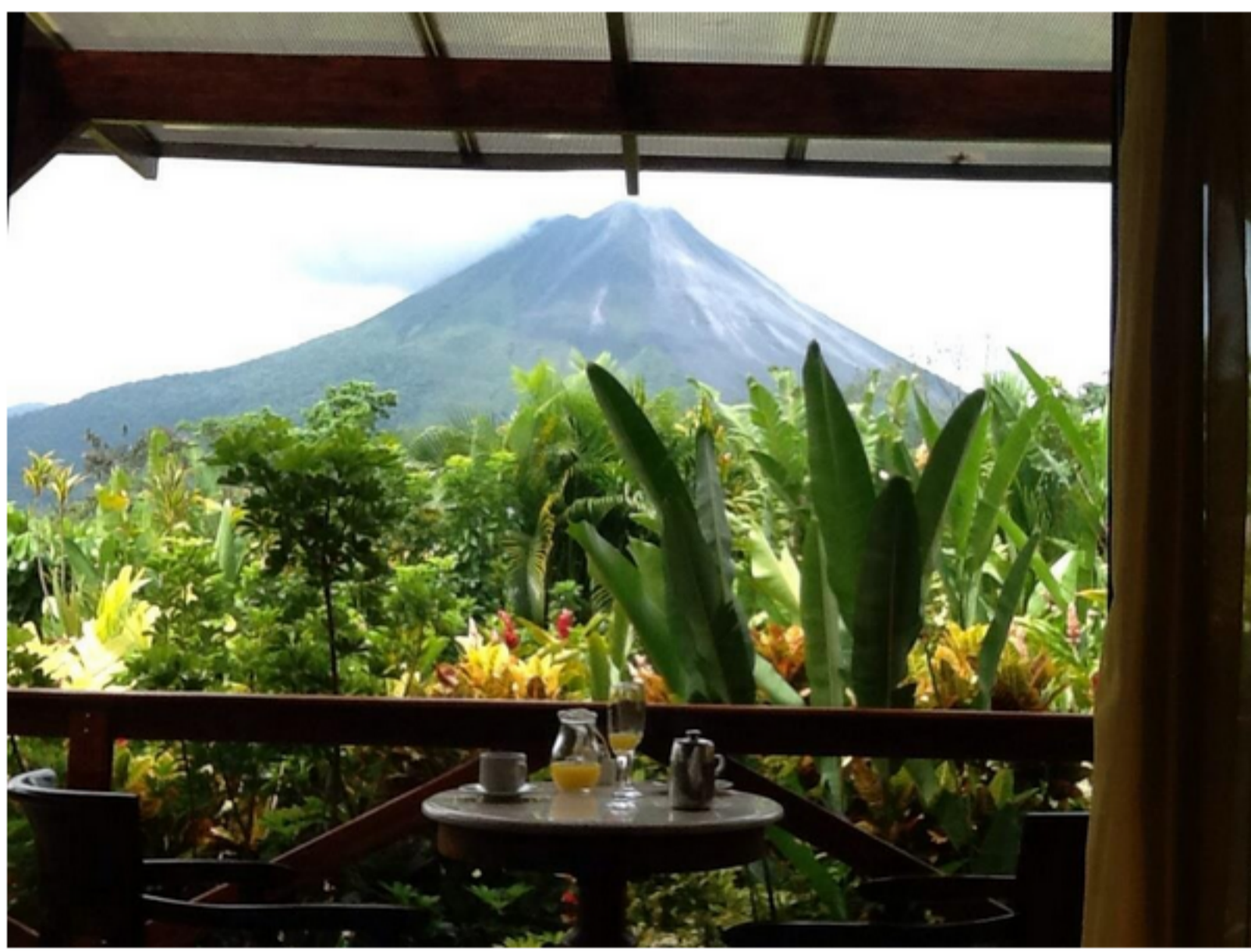
A simple breakfast and stunning view at Nayara Hotel.

Pura vida is a simple phrase that means "pure life." It is a greeting heard as frequently as "hello" -- on every street corner, restaurant and even home in Costa Rica. At the beginning of my travels to La Fortuna de San Carlos in the La Ajuela province, I smiled fondly in response to the phrase from the people who spoke it. But, by the end of my weeklong trip, I internalized these words and understood them deeply.